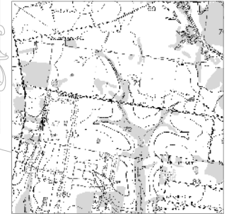
VICINITY MAP SCALE: 1" = 200'